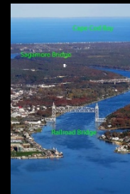
BTTS location in Cape Cod Canal with water velocity profile provided by WaterCube.